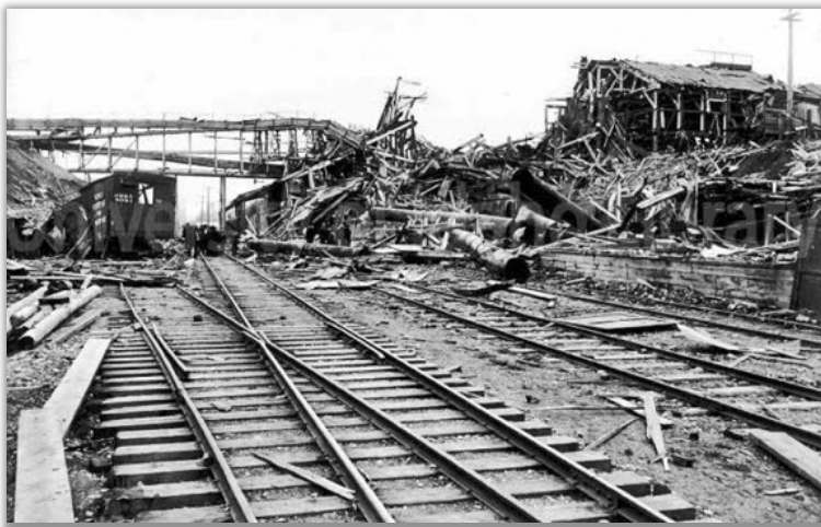
The mill at Wardner after the explosion.