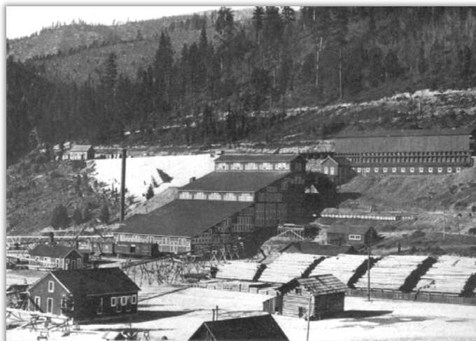
Morning Mine, Mullan, Idaho, circa 1908.