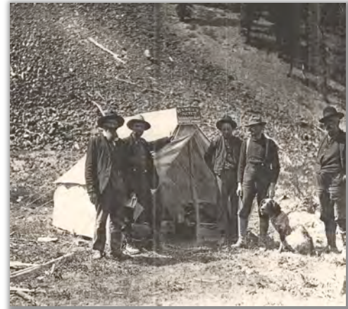
Hawley & Puckett Law Office, Thunder Mountain.